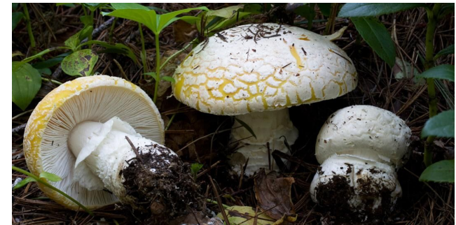
Amanita aprica