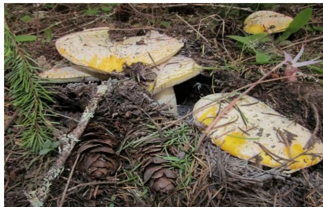
A. aprica can be found in clusters or all by themselves.

If your pet, usually dogs, exhibits two or more of the following symptoms, and you suspect he/she may have eaten a wild mushroom, get your pet to a veterinarian as soon as possible. This could be a medical emergency with deadly consequences