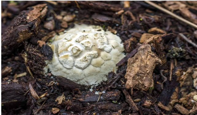
Both A. aprica and A. pantherina look like this when first emerging.

One key to getting your pet the necessary medical attention is proper identification of the mushroom he/she may have eaten. See the back of this brochure for what to look for. Be sure to check your yard regularly and keep a watchful eye on you pets while out in the woods during the warm months of the year.