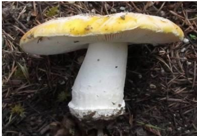
A. aprica fully fruiting.