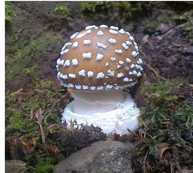
dog parks and yards Amanita pantherina